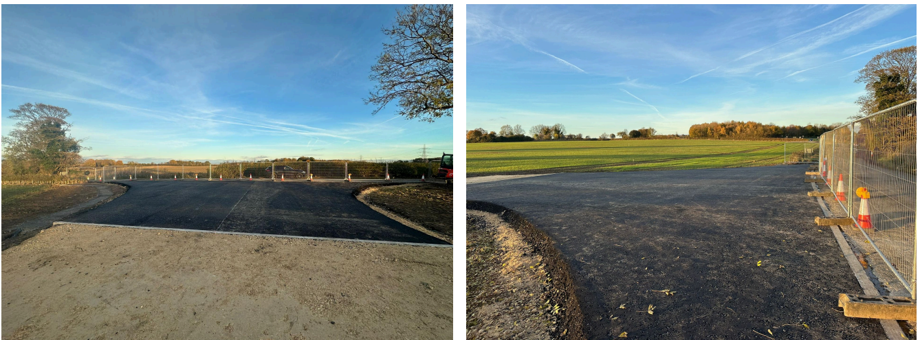
Image caption: Photographs of a bellmouth that has been constructed at Monk Fryston.