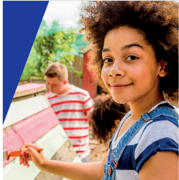
Image caption: Community benefit initiative.

One award has already been granted to a group situated near to the route, and more announcements are planned in the near future. We will share further details of those awarded in future e-newsletters.