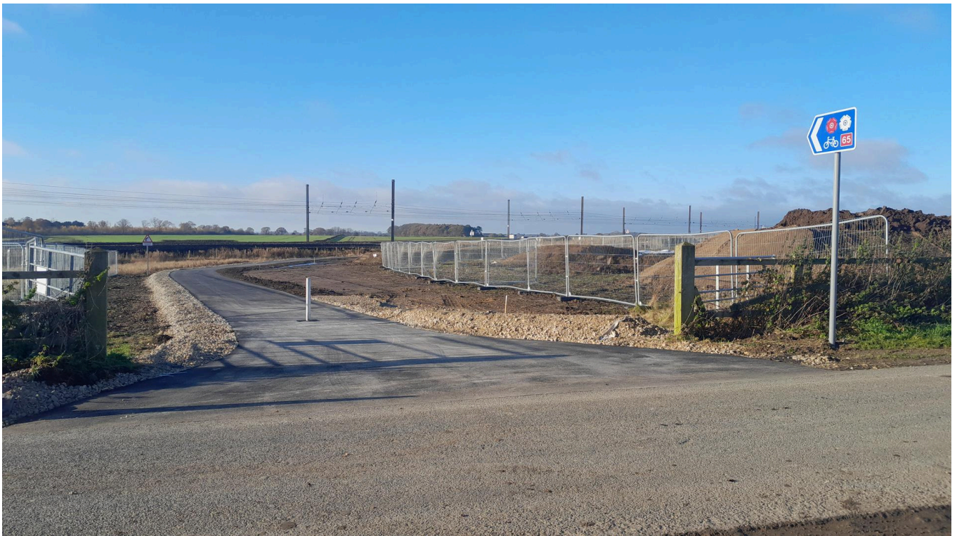
Image caption: Alternative cycle route between Overton Road and Station Road.

We are encouraging all pedestrians and cyclists to use this route during construction.