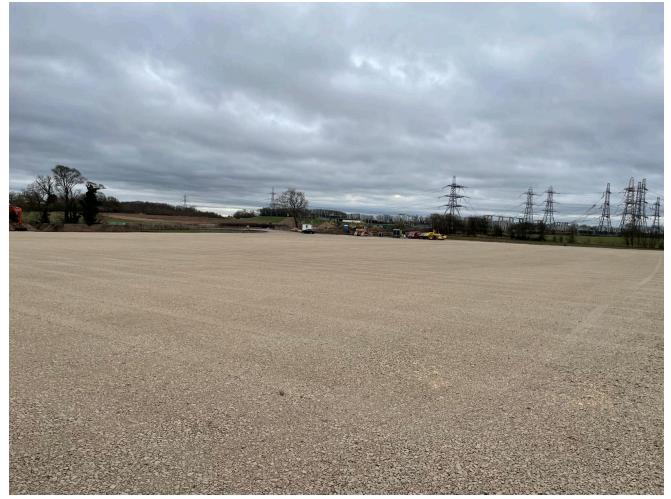
Image caption: Photographs of the stone compound site at Monk Fyston. This area will be used to house our welfare cabins, main site offices and storage of materials and equipment during construction.

To keep members of the public and our teams safe while carrying out our preparatory activities, we have installed temporary traffic management measures near to our sites.